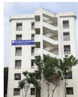
College of Nursing