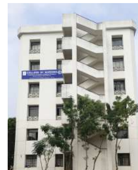
College of Nursing